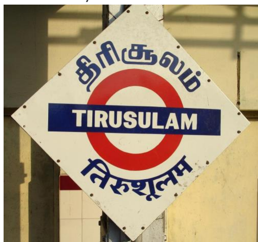
Tamil, English and Hindi name board at the Tirusulam suburban railway station in Chennai.

Many countries have more than one officially recognized national language, including Canada (English and French), Switzerland (French, German, Italian, Romansch), South Africa (11 languages), and India (22 languages). It's not the case that in multilingual societies all speakers are necessarily multilingual. Particular languages may be spoken predominately in one region, as is the case for French in Canada or Italian in Switzerland. In other cases, language use may be distributed according to ethnic heritage, as can be seen in Singapore or Malaysia. In some countries, there may be different versions of a common language, as is the case in Switzerland with Swiss German and standard German. This