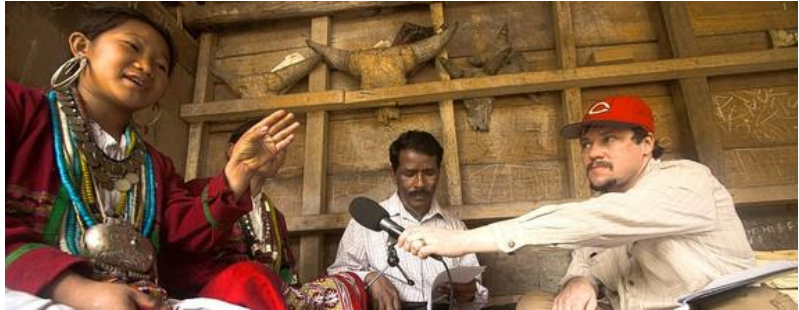
Linguist Gregory Anderson interviews a Koro speaker in India

It is estimated that there are between 5000 and 7000 human languages. It is difficult to provide an exact count, as differentiating languages from dialects is often difficult. It is also the case that languages die, as the number of speakers dwindle. That is particularly the case with indigenous languages in the Americas and Asia. Endangered languages can become extinct, and today this is happening at an alarming rate, for multiple reasons; often cited are globalization and the rise of English as a world language. Several TED Talks highlight the work of field linguists (a branch of anthropology) to capture recordings of endangered languages in an effort at preservation (see resource list). Modern technology makes it much easier to document and archive language use. However, those same technological advances bring the outside world into formally isolated areas, inevitably favoring the spread of dominant languages such as Spanish, Chinese, and English.