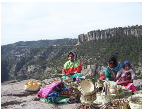
Tarahumara women, Mexico

Linguist Steven Pinker's (2007) research has shown that in fact language is not the only existing means of thought. It is possible for us to picture reality through mental images or shapes. In recent years, there have been a number of studies on the perception of colors related to available color words. Languages differ in this area. Some, for example, do not have separate words for blue and