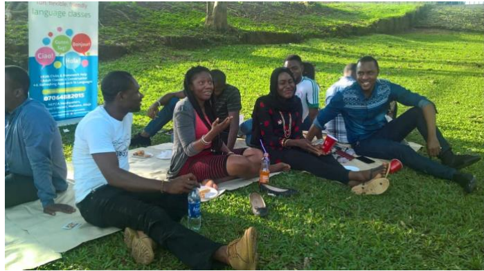
Learning German at the Smarter Language Academy in Nigeria

While digital resources for language learning proliferate today, the traditional access to language learning materials is the textbook. Since the early 19 th century textbooks have provided the essential structure and content for both teacher-led and self-taught language learning. The rich multimedia environment for language learners is a fairly recent phenomenon (see Otto, 2017).