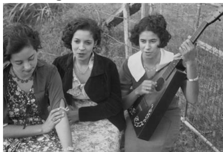
Three Creole Girls, Louisiana, 1935

The existence of a hybrid language such as Haitian Creole is one indication of the significant link between language and culture. Languages are rarely used in their "pure", standard form. Speakers adapt linguistically to others around them. If we come often enough into contact in our everyday lives with groups of speakers of other languages, that is likely to have an influence on our own use of language. That may manifest itself in vocabulary. The English language has such a rich vocabulary because it has borrowed and incorporated words from many different languages over the centuries. In Germany today, the large number of Turkish immigrants has led to the common use of particular Turkish expressions such as lan for mate/man or valla for honestly in everyday speech in German. Creoles develop when there are significant numbers of speakers of different languages who interact on a regular basis. In the US state of Louisiana, the mix of different nationalities