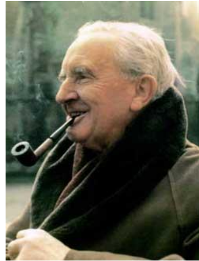
Author JRR Tolkien knew many languages and invented languages

Ultimately, if or how well learners acquire a second language depends on the individual. One's attitude is a crucial factor. If one is highly motivated to learn because of extrinsic factors, such as a migrant's need for functional ability in an adopted country, that can lead to more intense and faster learning. There may be compelling professional reasons for needing to learn a second language, such as being posted to a foreign country. Intrinsic motivating factors may play a role. Those might include a desire to learn more about another culture to maintain or establish a connection to one's ethnic heritage. Polyglots , speakers of multiple languages, are motivated to learn as many languages as possible (see resource list for examples).