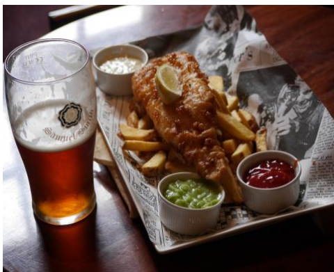
Beer in Germany: a drink like any other

Learning a second language leads one early on to appreciate the fact that there may not be a one-to-one correspondence between words in one language and those in another. While the dictionary definitions ( denotation ) may be the same, the actual usage in any given context ( connotation ) may be quite different. The word amigo in Spanish is the equivalent of the word friend in English, but the